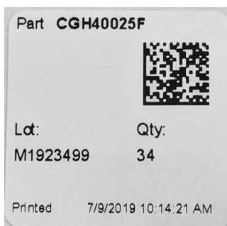
Figure 2 – Label on the individually bagged trays or reels.

Tray and Reel labels (Figure 2) include a bar code. The bar code is in the format : %$<part>$<lot>$Q<qty>$%. For the example label below, the read-out is %$CGH40025F$M1923499$Q34$%